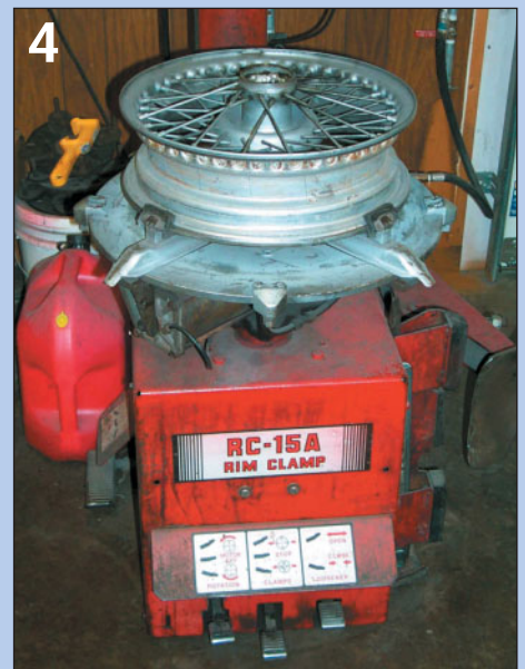
1. Hendrix Wire Wheel has adapters for virtually any type of British wire wheel. 2. Wheels or drums can be mounted to the balancer using lug nuts to perfectly mimic how they will behave on the car. 3. Shaving the high points off tires is key to getting the shake out. 4. Hendrix Wire Wheel has a European-style tire mounter that won’t bend the spokes on a wire wheel.